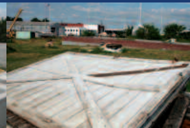
Doors and walls from the old Gannon Farm in Easton will be incorporated into the new building.