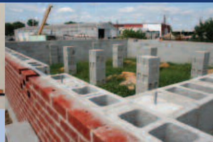
The foundation of the new Ruark Boatworks building, as of September 2009.